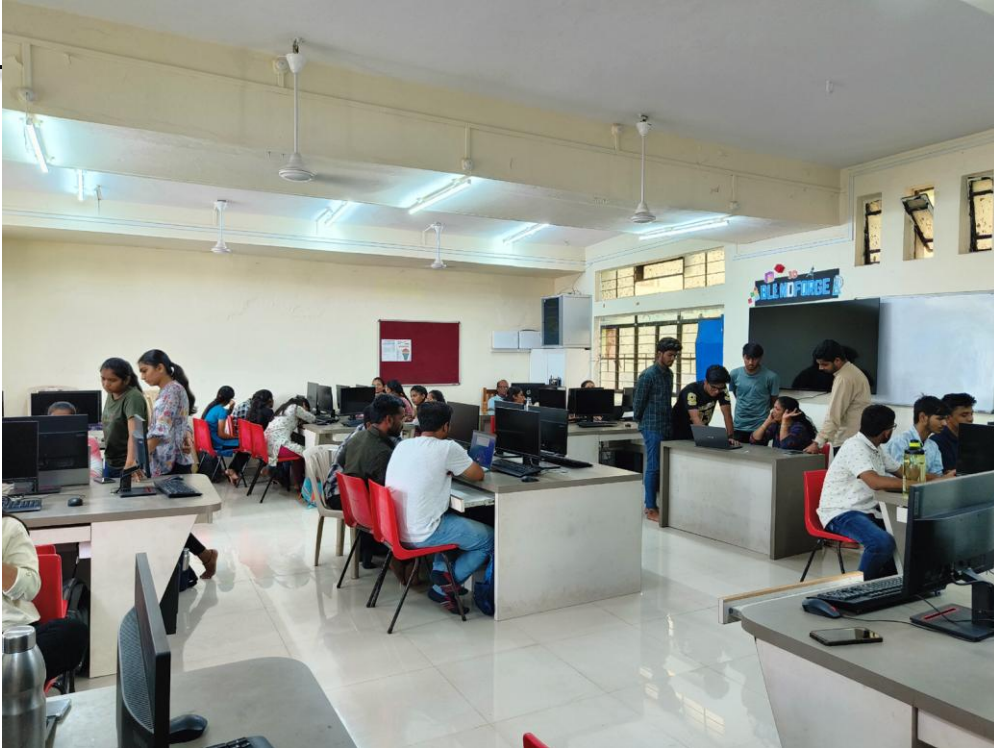
Advanced Programming Lab